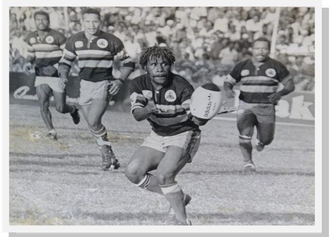
Paga Panthers, old Lloyd Robson Oval in 1991.

He played with Paga Panthers and Tarangau prior to joining the Kumuls then went on to play professional rugby league in France with the Carpentras rugby league club in 1992 after retiring from the Kumuls. The Kumuls number 142 has been involved in rugby for 36 years now as a player, administrator and coach