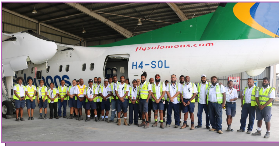
Part of the engineering team that did c checks on Solomon Airlines Dash 8

The MRO facility has already completed its first full service on a Dash 8 belonging to Solomon Airlines. The service centre specialises in heavy maintenance checks known as a C check which is a mandatory major inspection of all aircraft after a certain period of time and flight hours. This opportunity will also give Air Niugini a new income stream that will massively contribute to the financial security of the airline