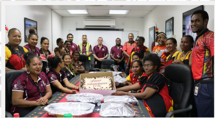
Staff of Link PNG and Air Niugini engineering having lunch to commemorate PNG's Independence Anniversary.

Staff of Link PNG, a subsidiary of Air Niugini, dressed in their best PNG colors to commemorate the country's 44th Independence anniversary on September 13th