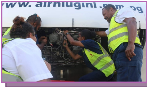
Engineers hard at work at the new MRO facility.

option for airline servicing for operators in Australia, Asia and the Pacific. "We have some of the best talent that I have seen in my 40 years